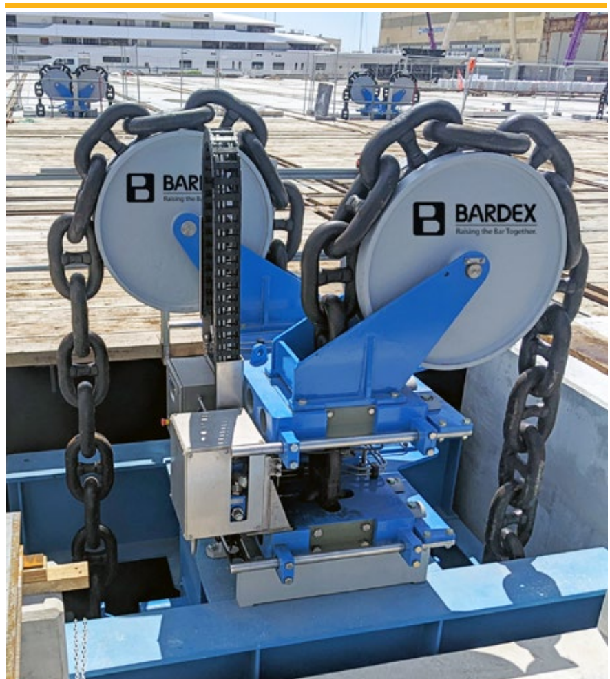
Chain jacks have been trusted to lift vessels since 1967.

Using locally produced concrete increases the local content of the project.